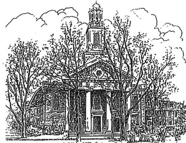
Flatbush-Tompkins Congregational Church Dorchester Rd. & East 18th St. Brooklyn - New York

424 East Nineteenth Street, Brooklyn, New York 11226 Tel. 718-282-5353 / Fax 718-940-0988